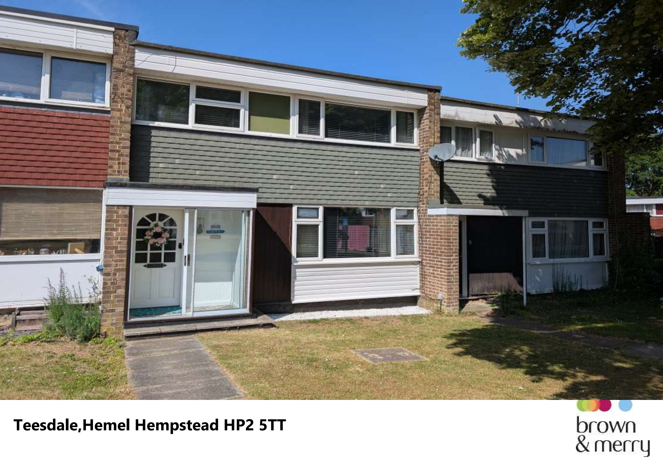
Teesdale, Hemel Hempstead HP2 5TT