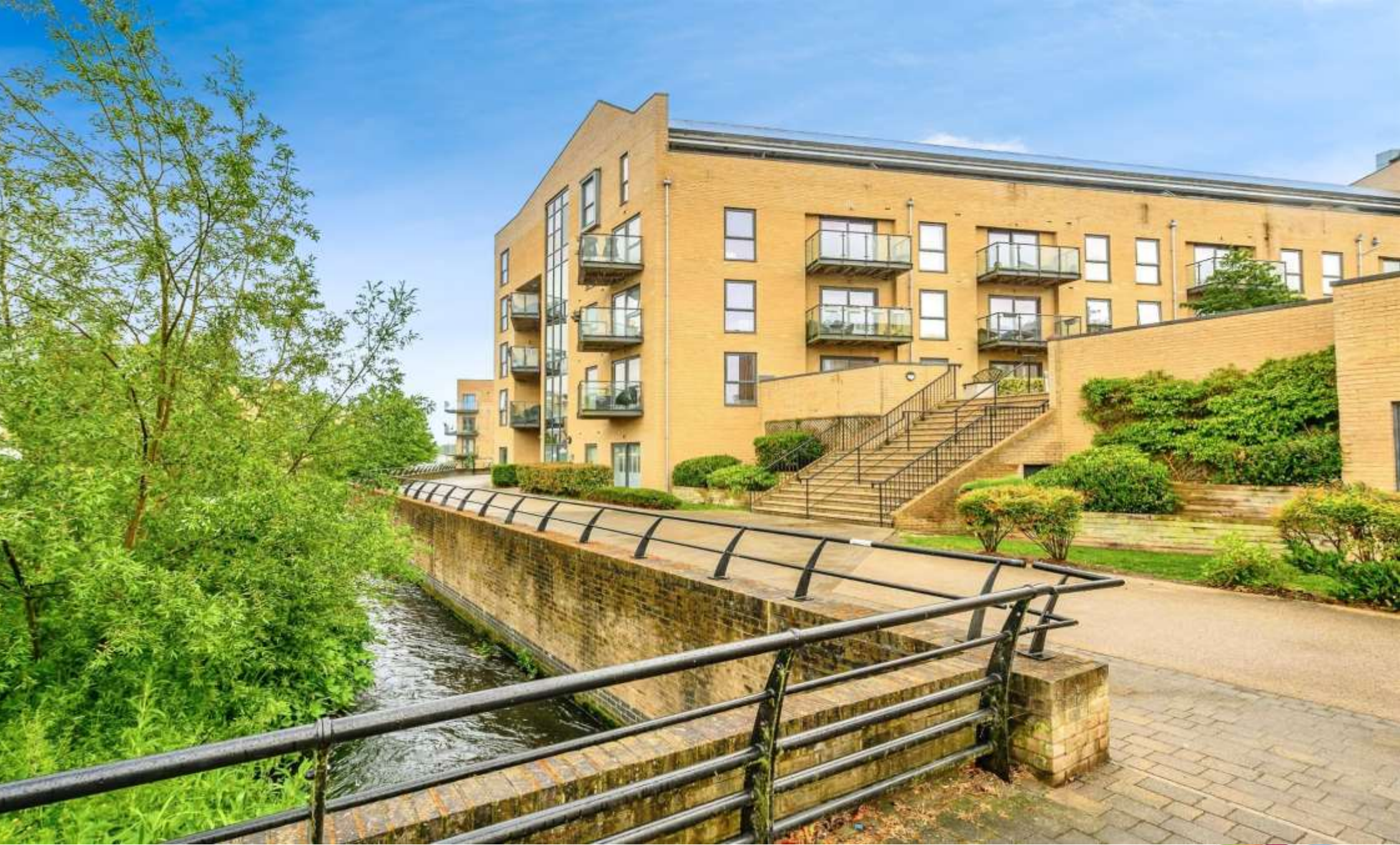
Richardson House The Embankment, Nash Mills Wharf HEMEL HEMPSTEAD HP3 9GA