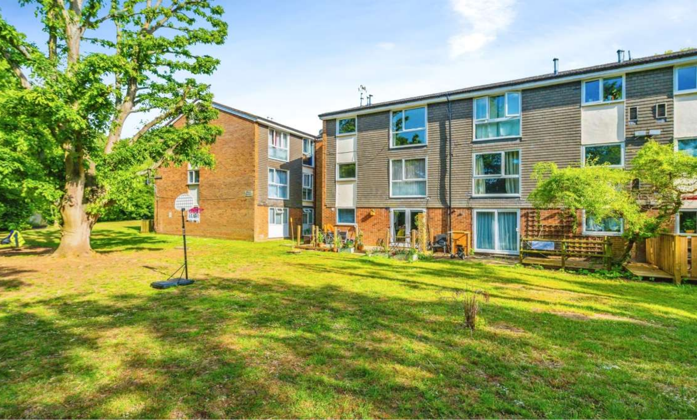
Cuffley Court, Hemel Hempstead HP2 7LS