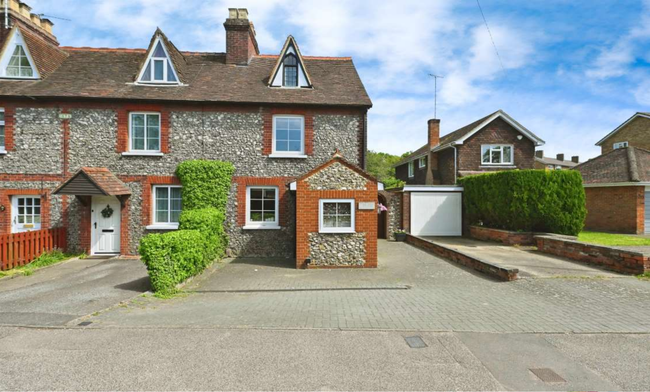
Flint Cottages,HEMEL HEMPSTEAD HP2 7AJ