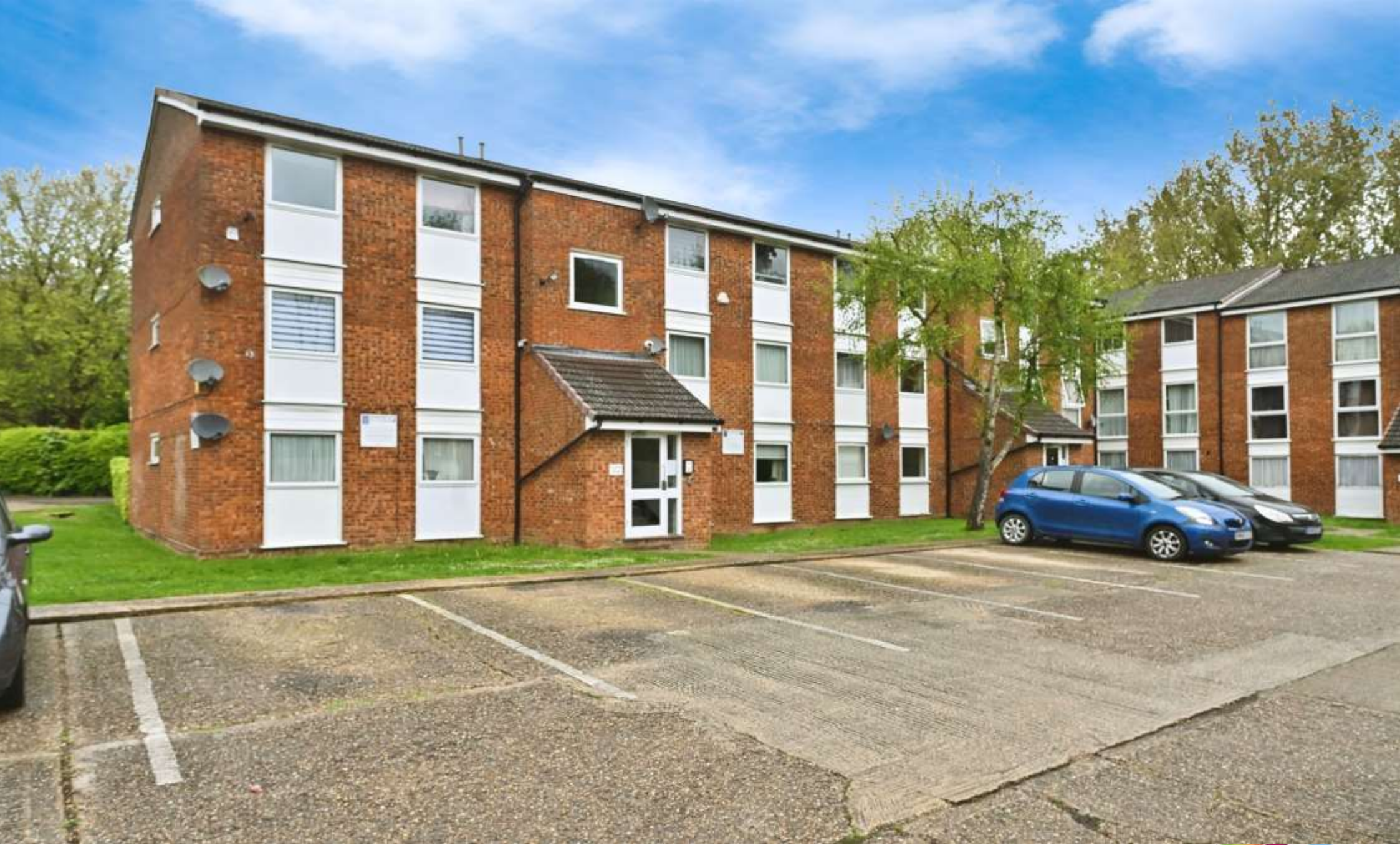
Arkley Court Arkley Road, Hemel Hempstead HP2 7JT