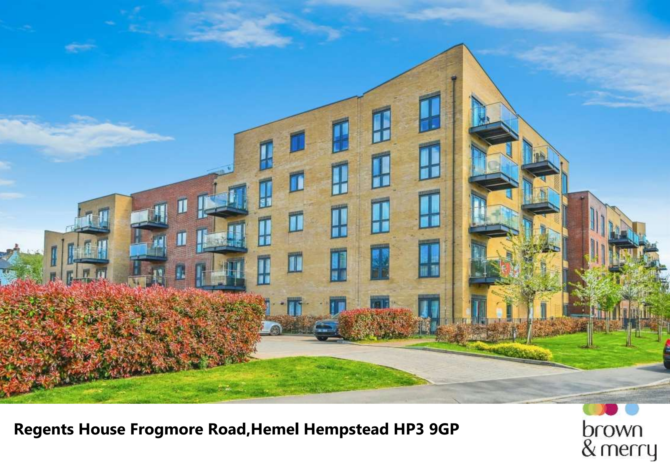
Regents House Frogmore Road, Hemel Hempstead HP3 9GP