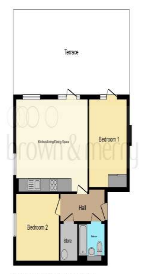
Total Floor Area 65.8 Sq M (708 sq.ft.) approx

This floor plan is for illustrative purposes only. It is not drawn to scale. Any measurements, floor areas (including any total floor area), openings and orientation are approximate. No details are gusranteed, they cannot be relied upon for any purpose and they do not from part of any agreement. No liability is taken for any error, omission or misstatement. A party must rely upon its own inspection(s). Powered by www.focalagert.com.