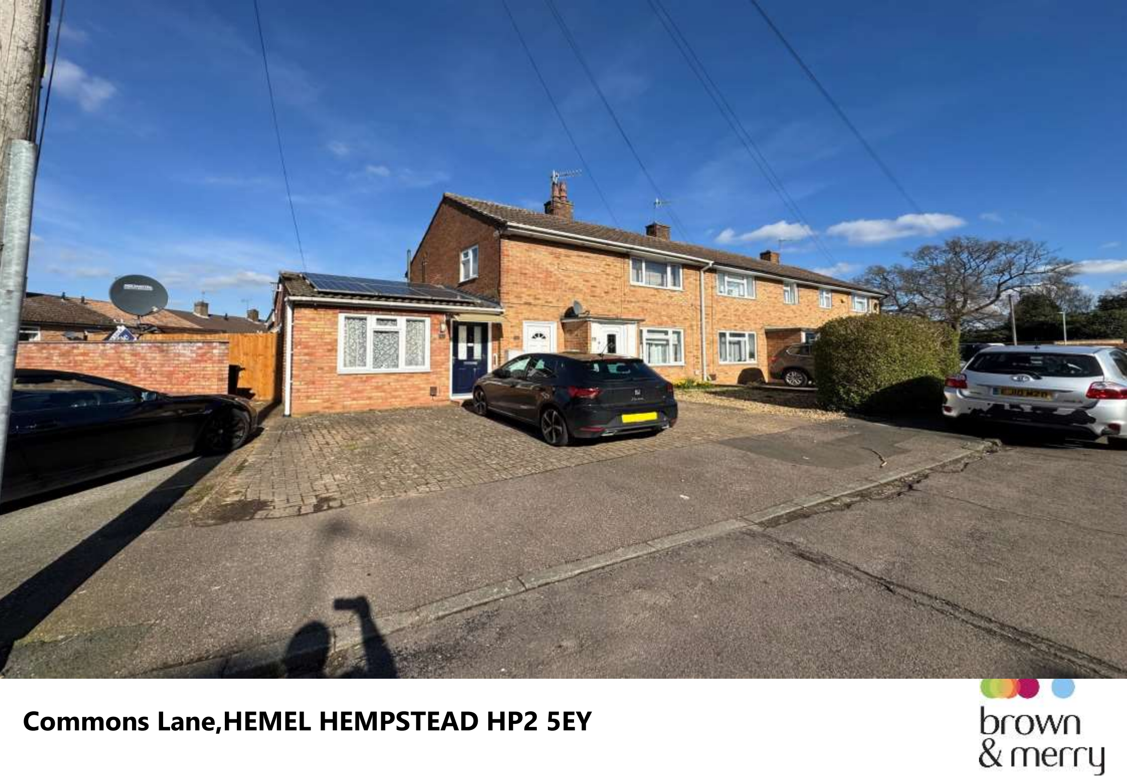
Commons Lane, HEMEL HEMPSTEAD HP2 5EY