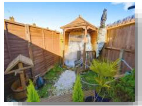
Flower Pots Day Nursery Coorde Map data @2025