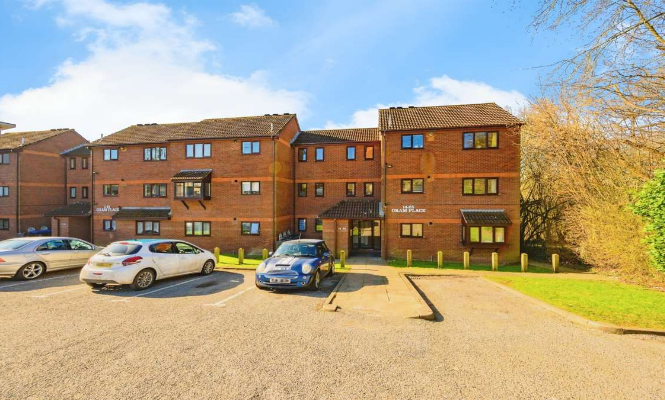
Oram Place Lawn Lane,Hemel Hempstead HP3 9NE