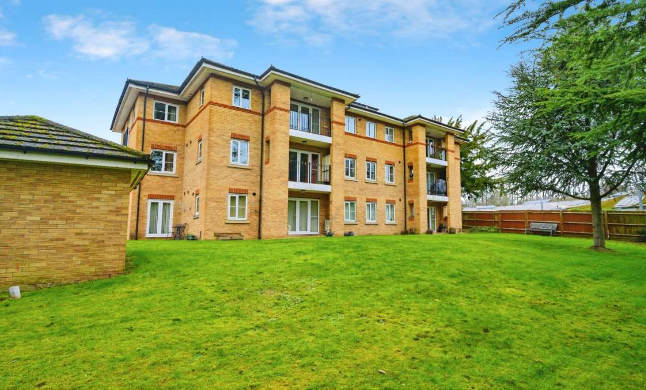
Smeathman Court Heath Lane, Hemel Hempstead HP1 1AH