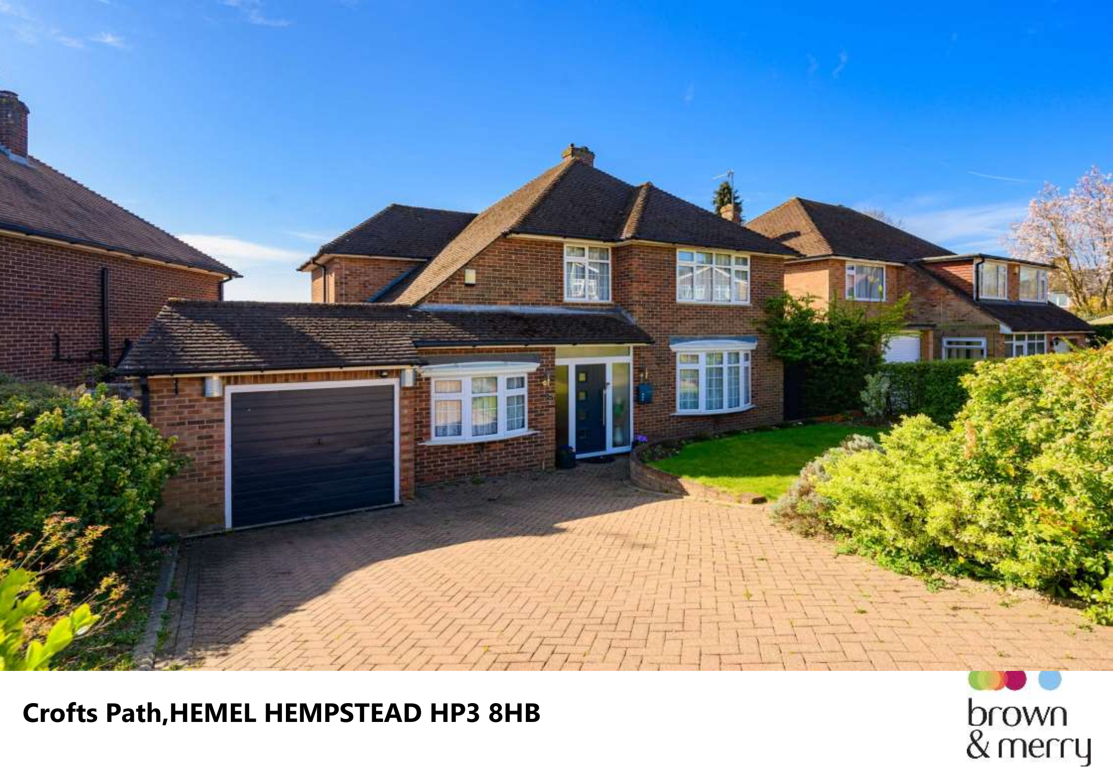
Crofts Path, HEMEL HEMPSTEAD HP3 8HB