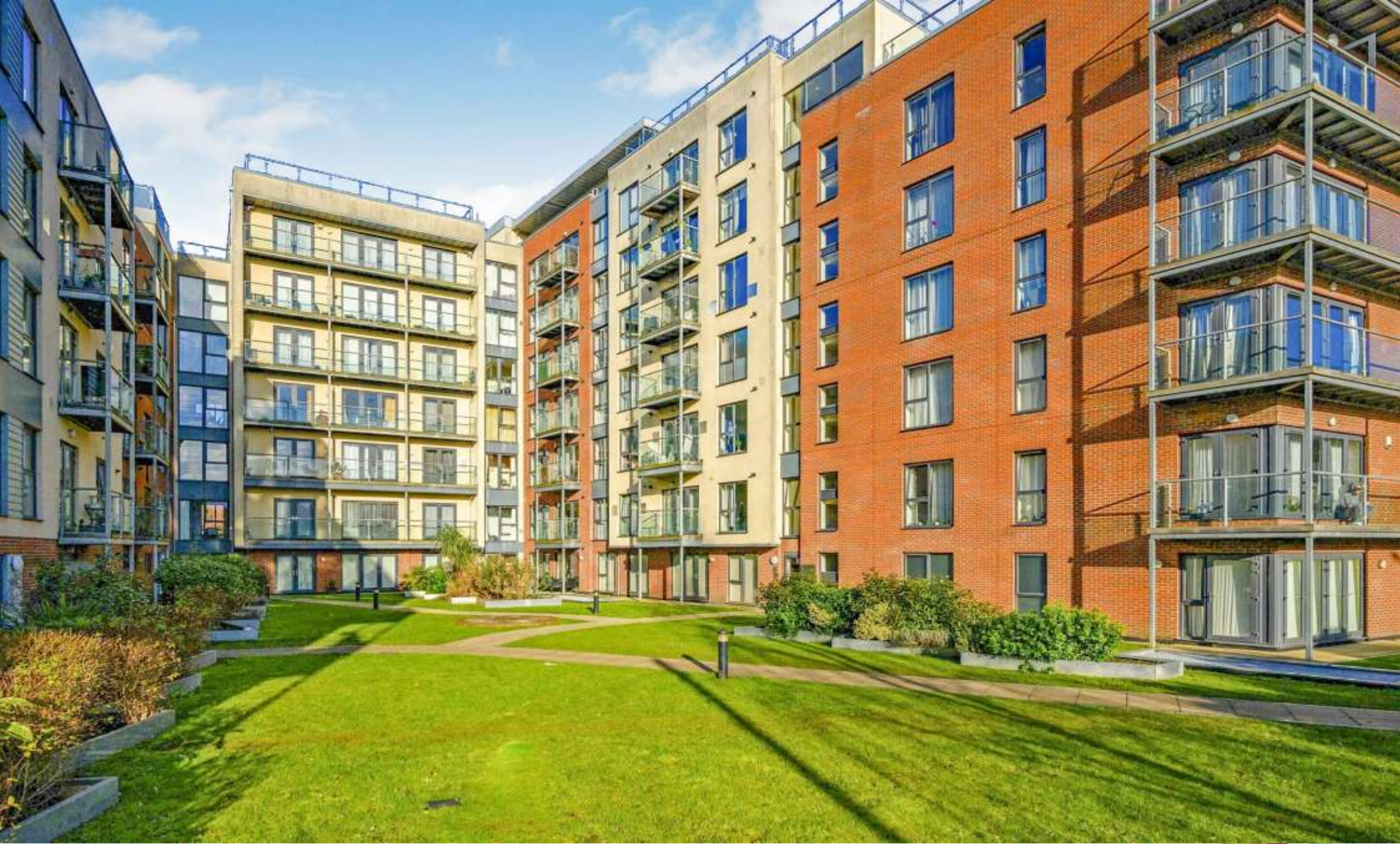
Mosaic House Midland Road,HEMEL HEMPSTEAD HP2 5YQ