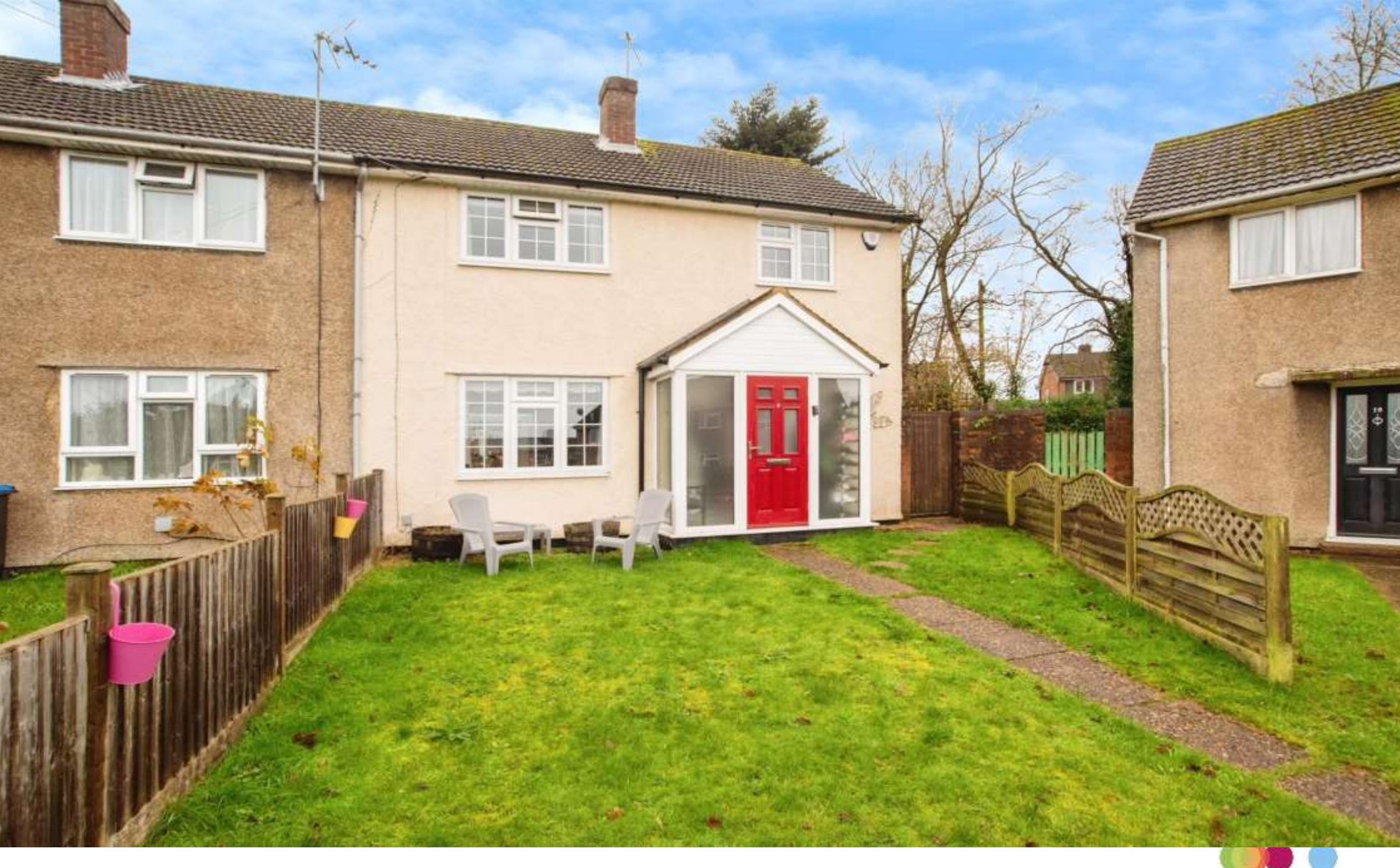
Brickmakers Lane, Hemel Hempstead HP3 8NY