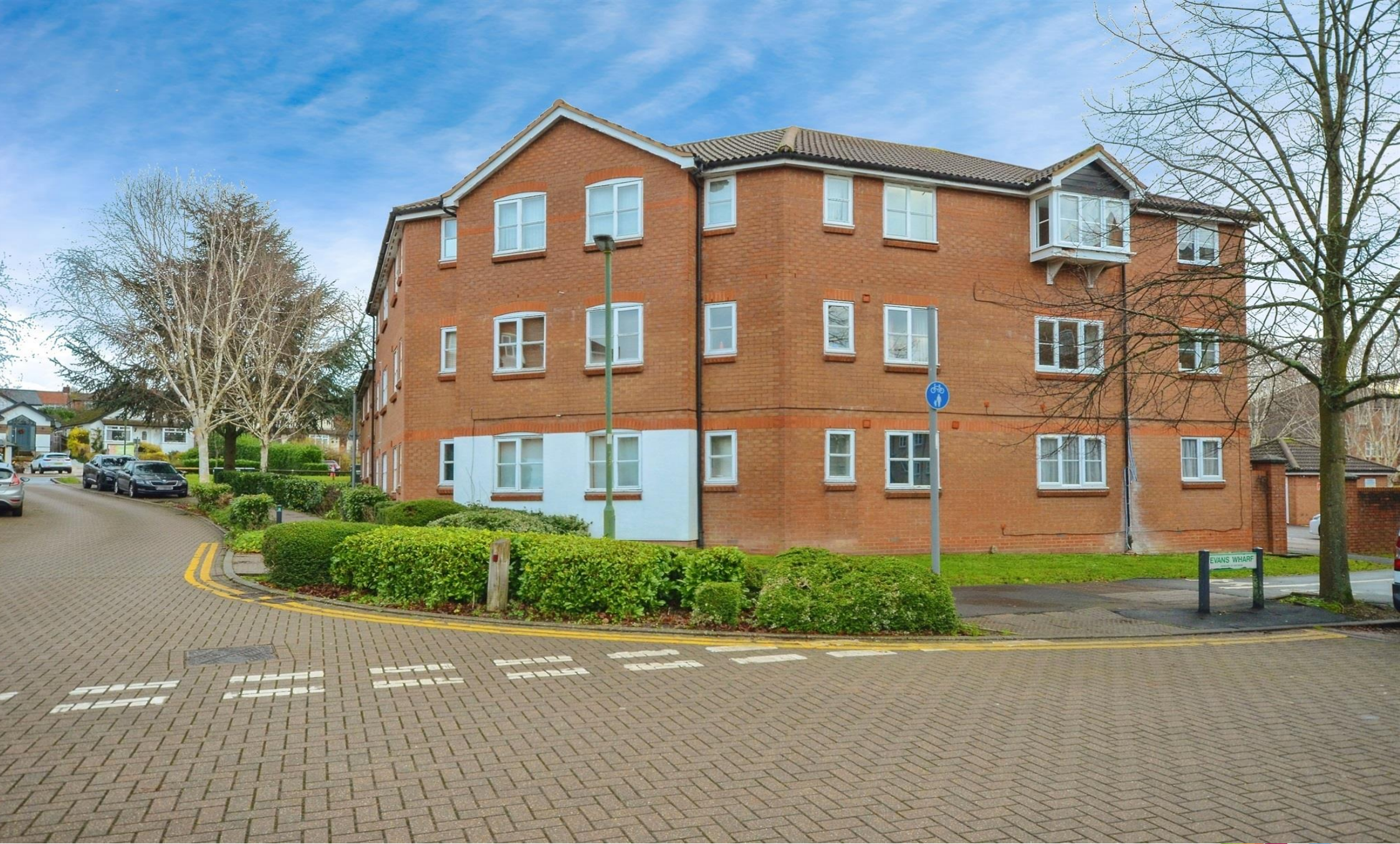
Barge House Evans Wharf, Hemel Hempstead HP3 9WE