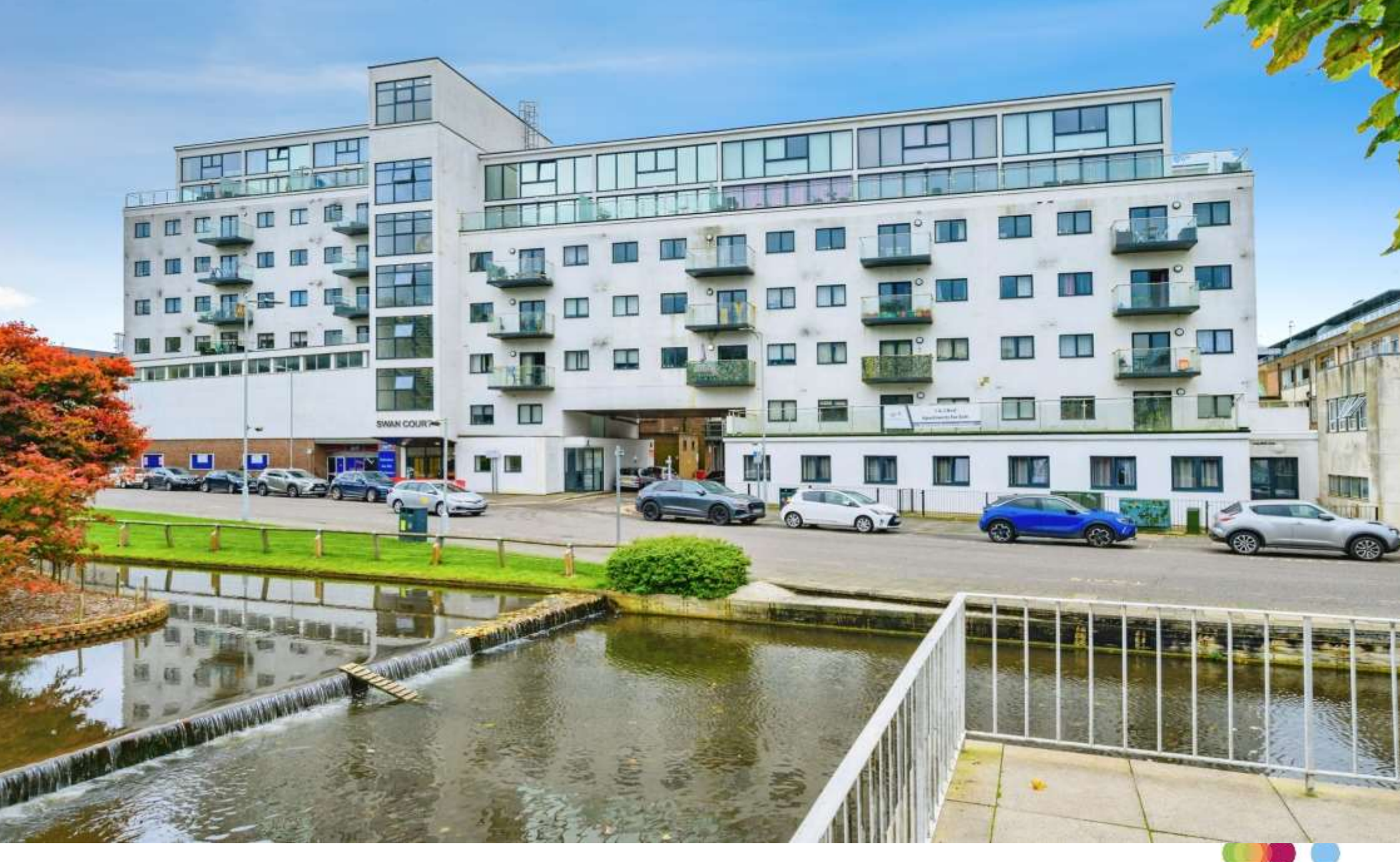
Swan Court Waterhouse Street, Hemel Hempstead HP1 1DS