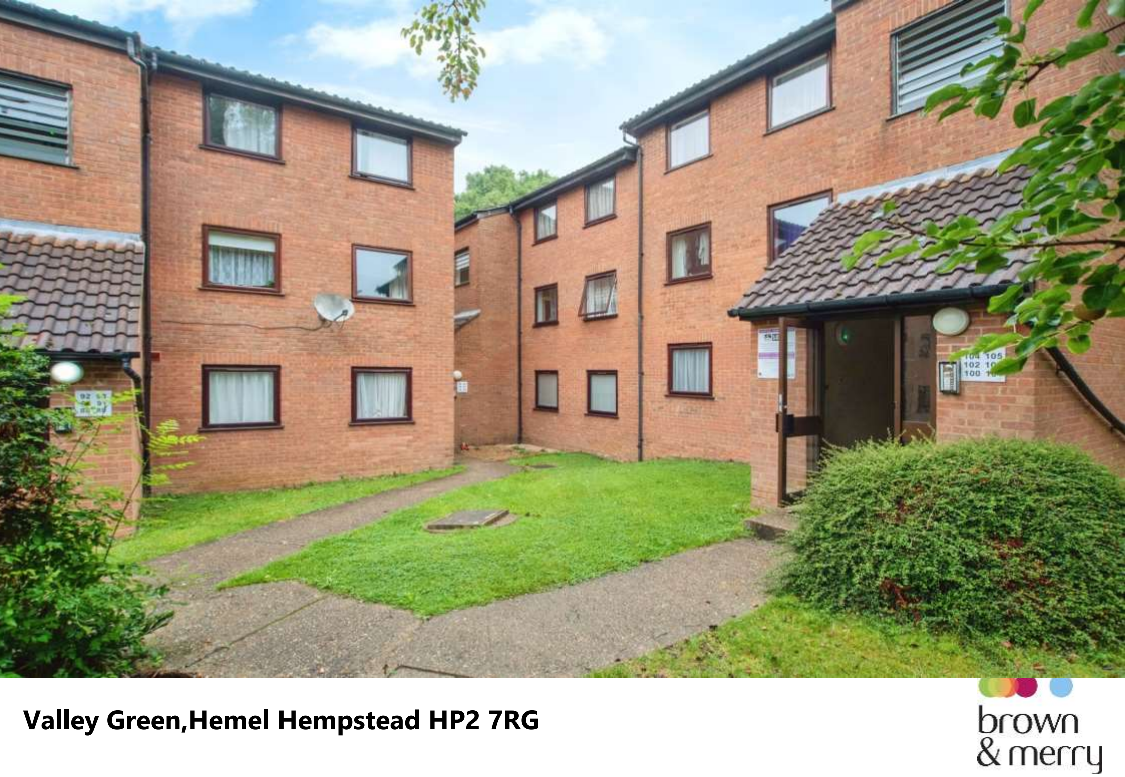
Valley Green, Hemel Hempstead HP2 7RG