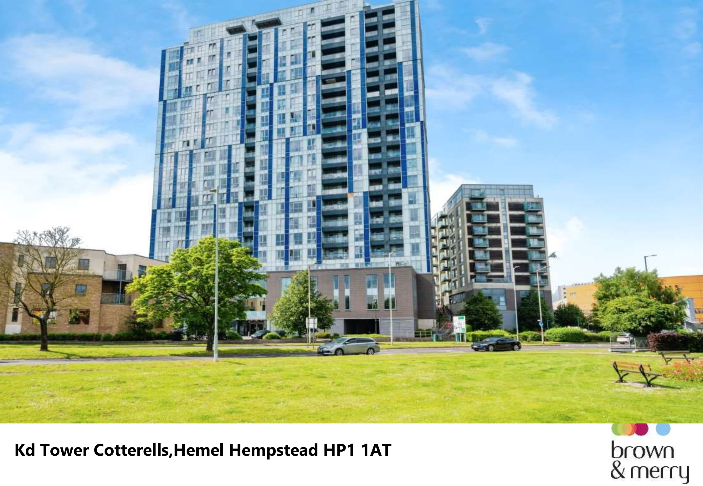
Kd Tower Cotterells, Hemel Hempstead HP1 1AT