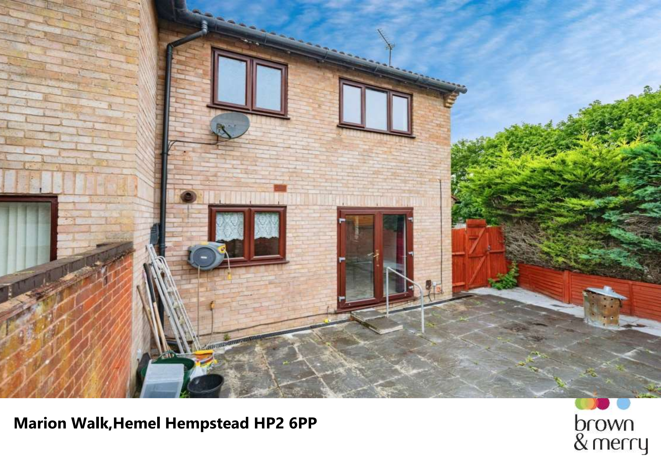
Marion Walk, Hemel Hempstead HP2 6PP