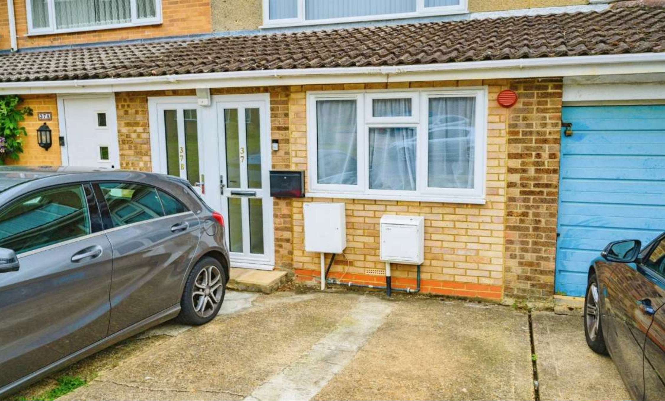
Ninian Road, Hemel Hempstead HP2 6NA