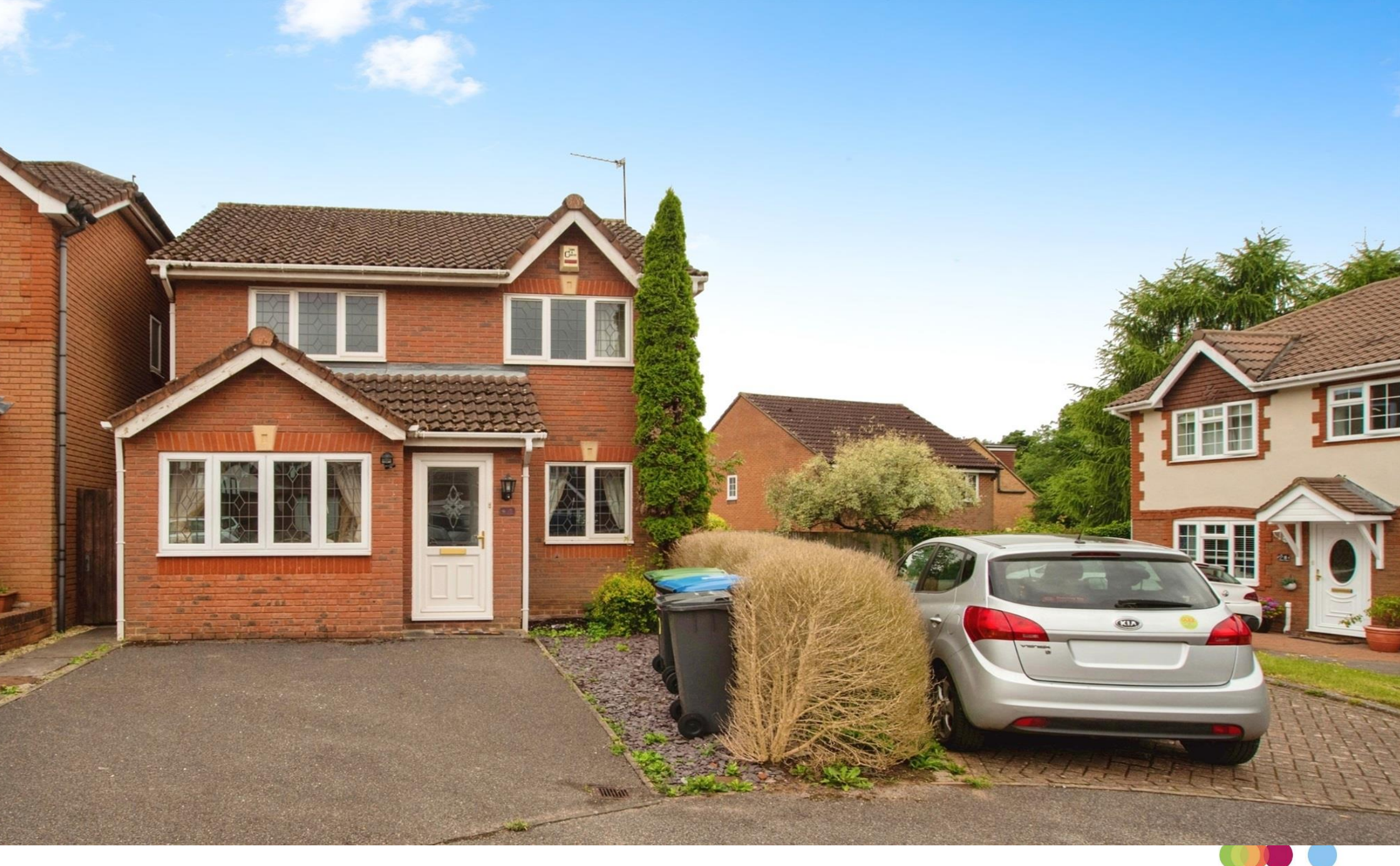
Caister Close, Hemel Hempstead HP2 4UQ