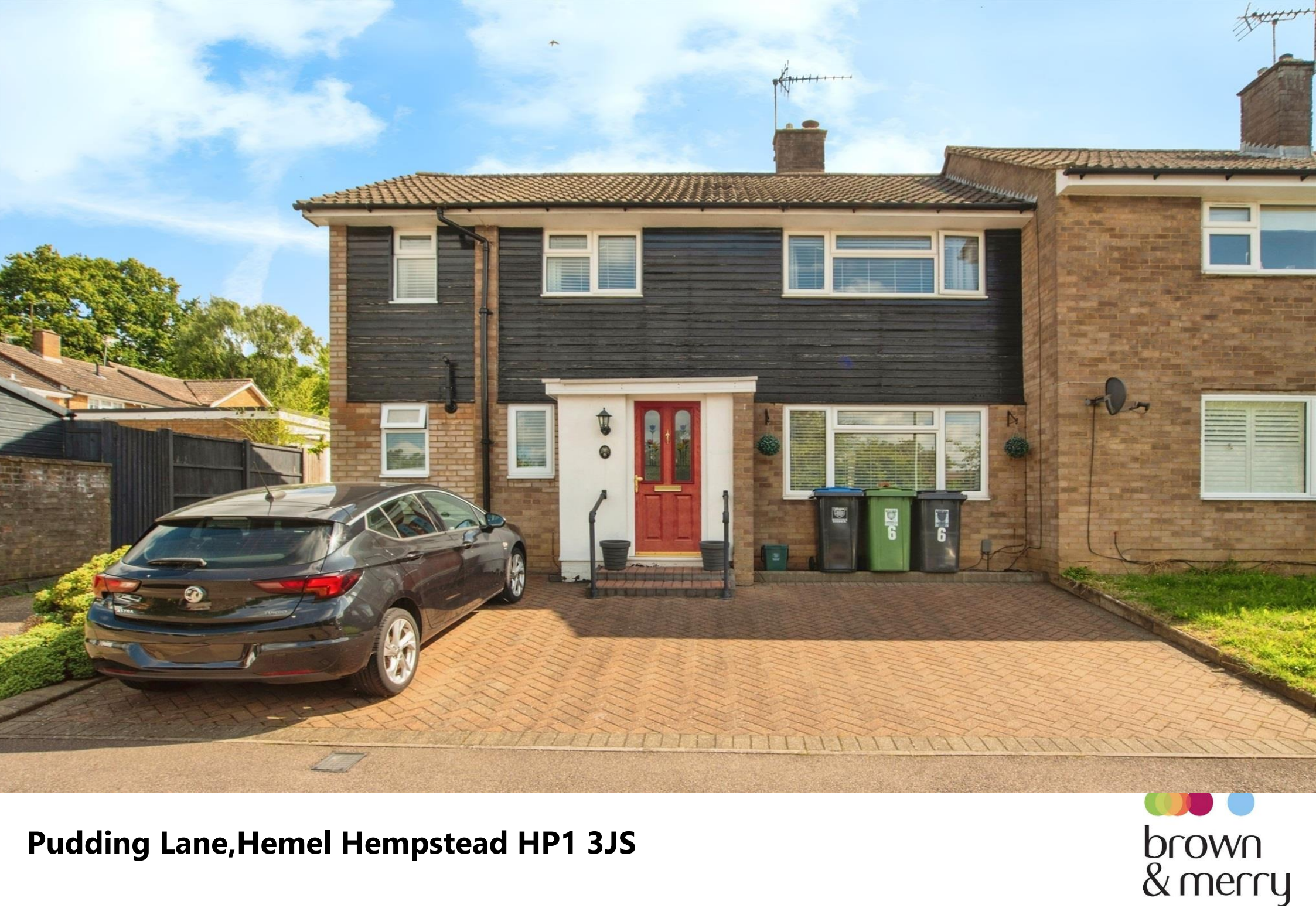
Pudding Lane, Hemel Hempstead HP1 3JS