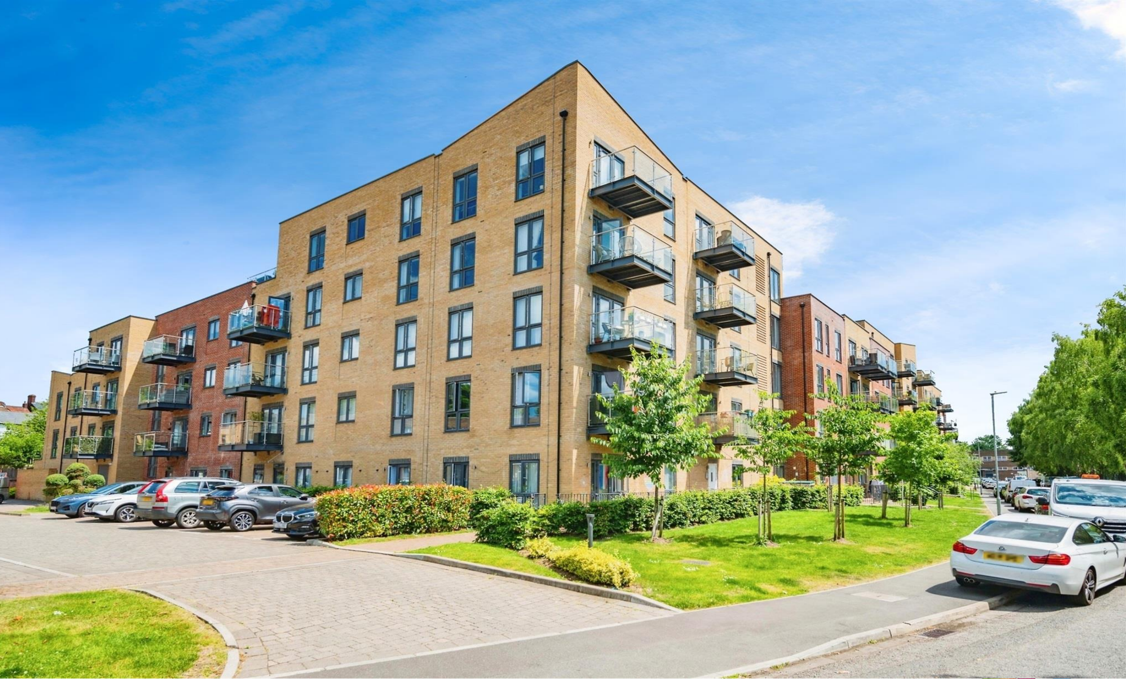
Regents House Frogmore Road, Hemel Hempstead HP3 9GP