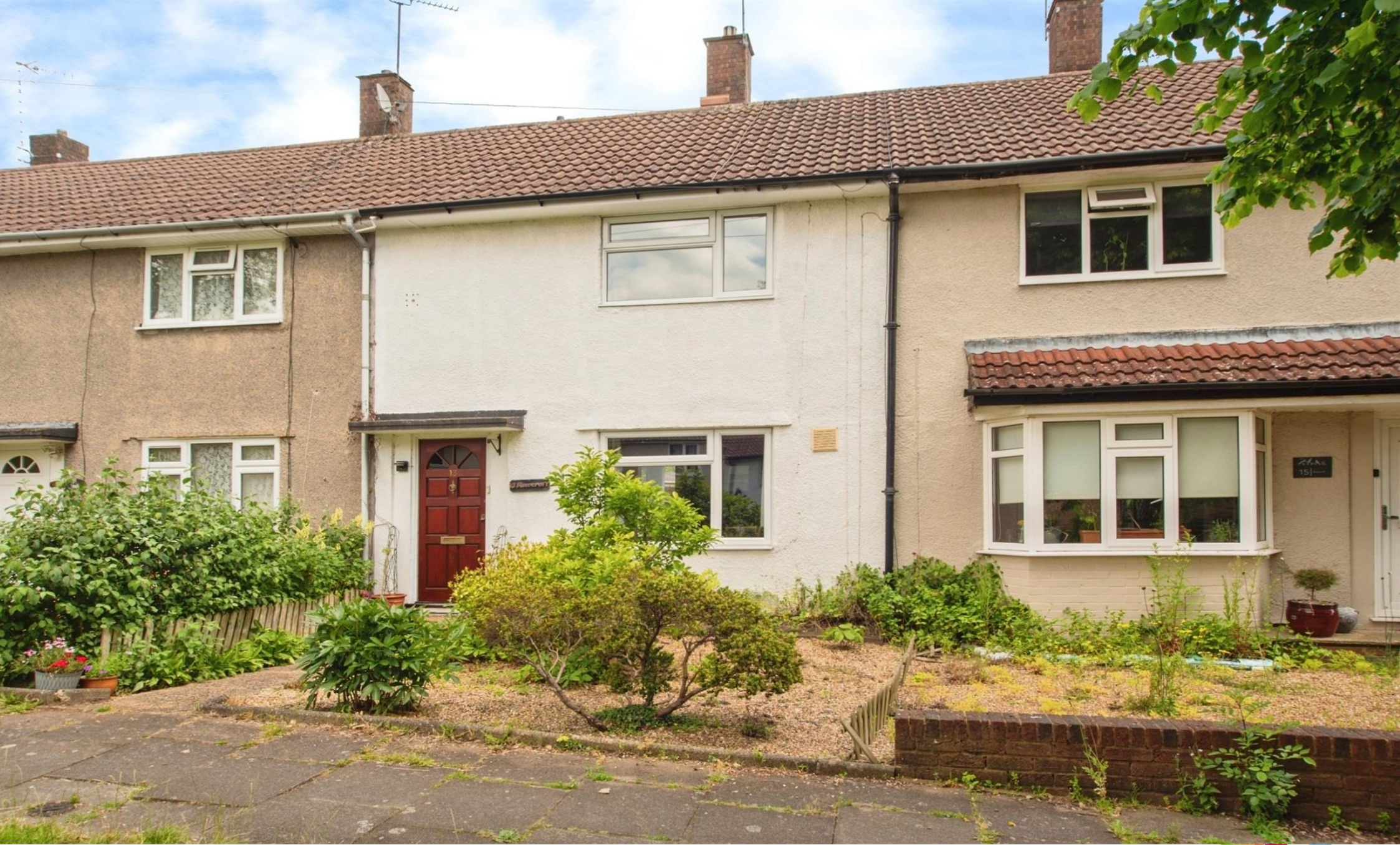
Rowcroft, Hemel Hempstead HP1 2JF