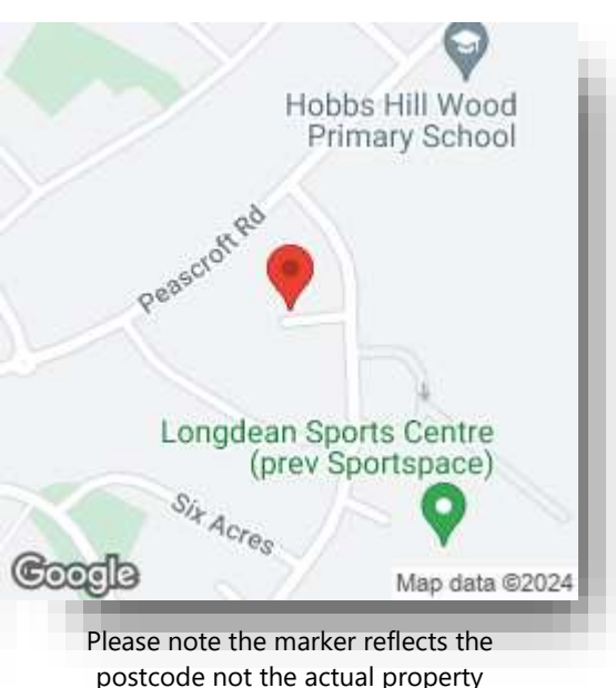
view this property online brownandmerry.co.uk/Property/HHD109544