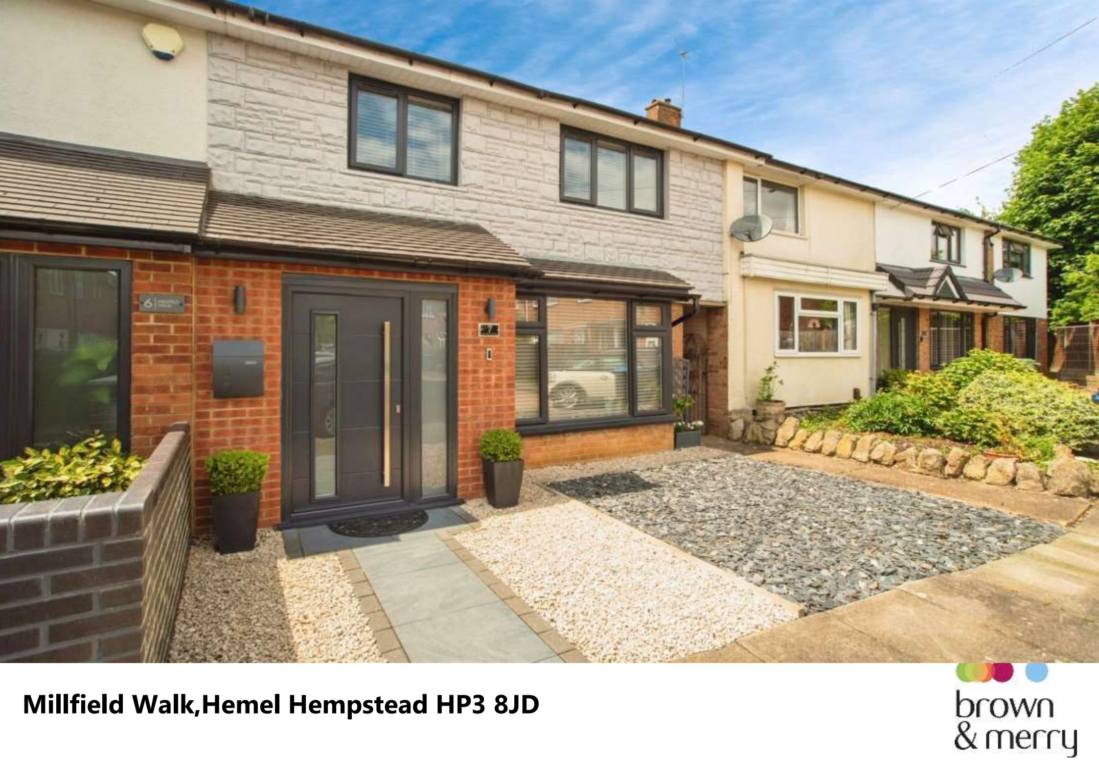
Millfield Walk, Hemel Hempstead HP3 8JD