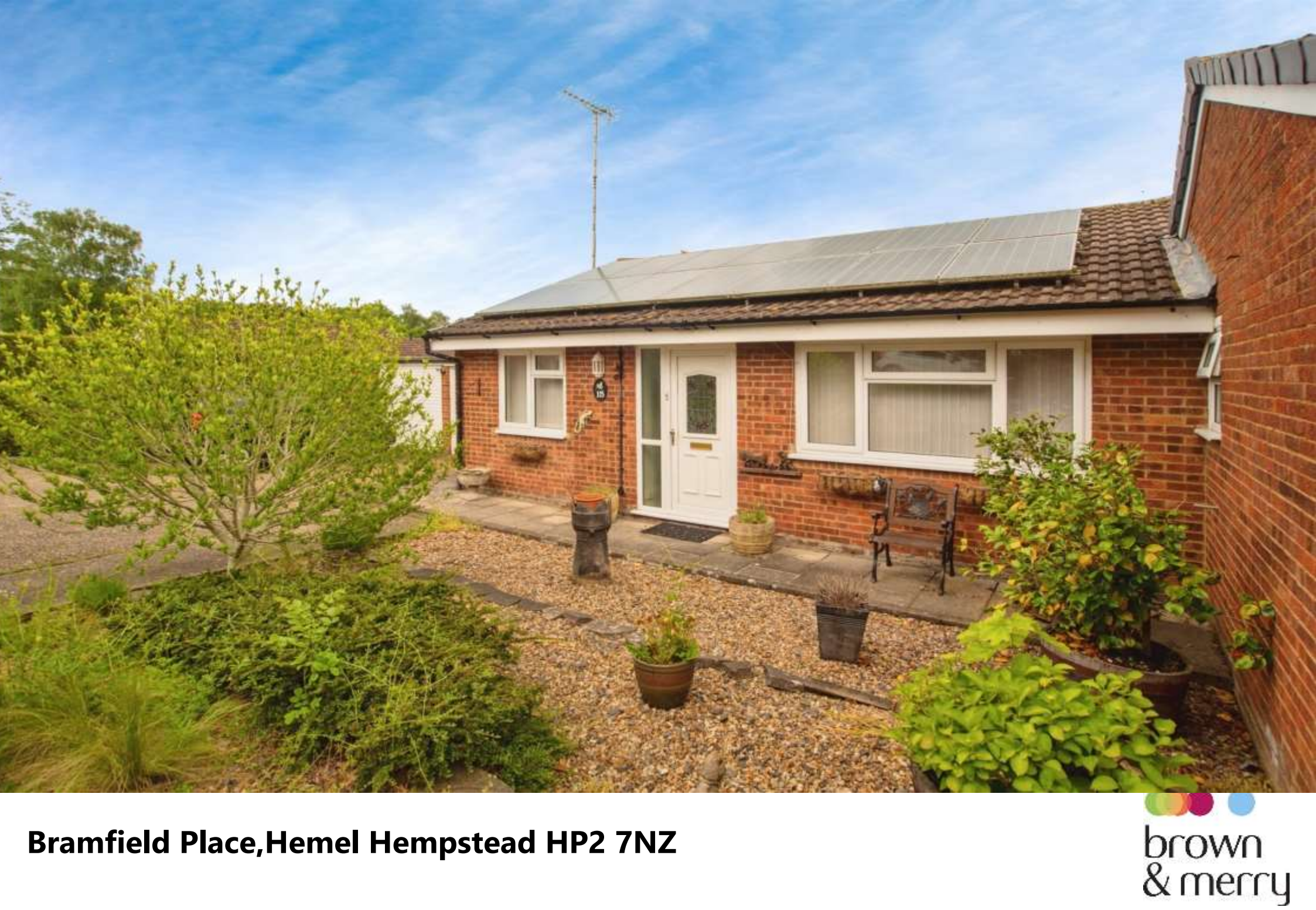
Bramfield Place, Hemel Hempstead HP2 7NZ