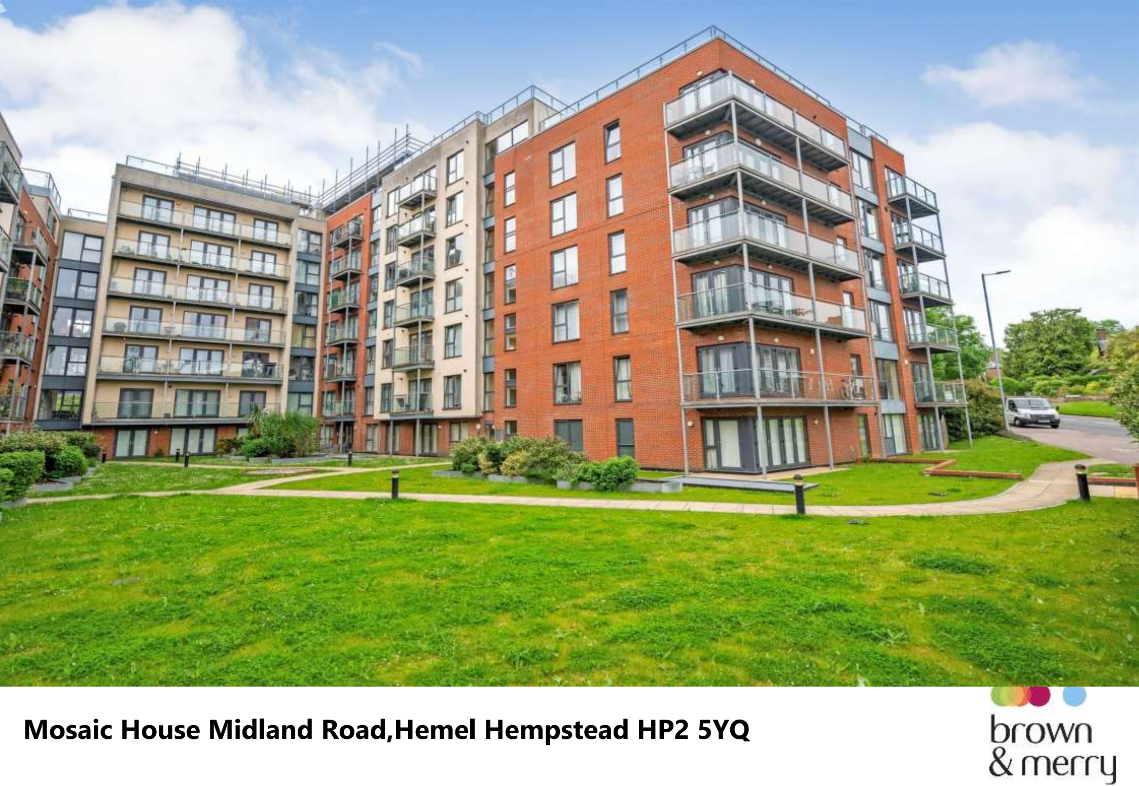
Mosaic House Midland Road, Hemel Hempstead HP2 5YQ