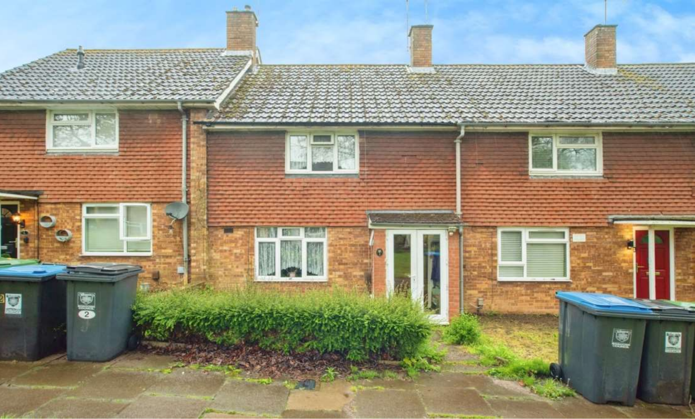
Maple Green, Hemel Hempstead HP1 3PY