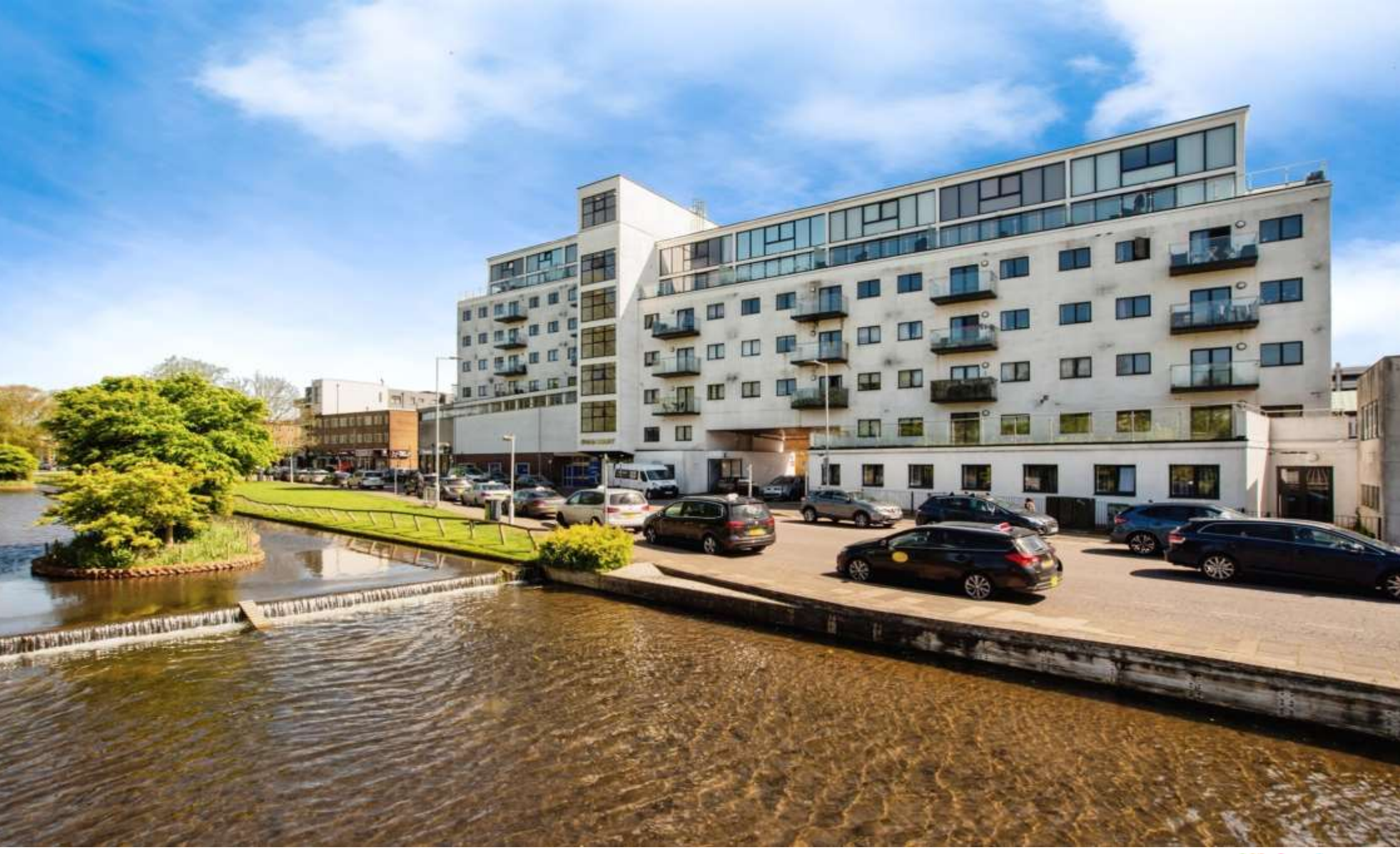
Swan Court Waterhouse Street, Hemel Hempstead HP1 1DS