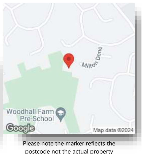
view this property online brownandmerry.co.uk/Property/HHD110217