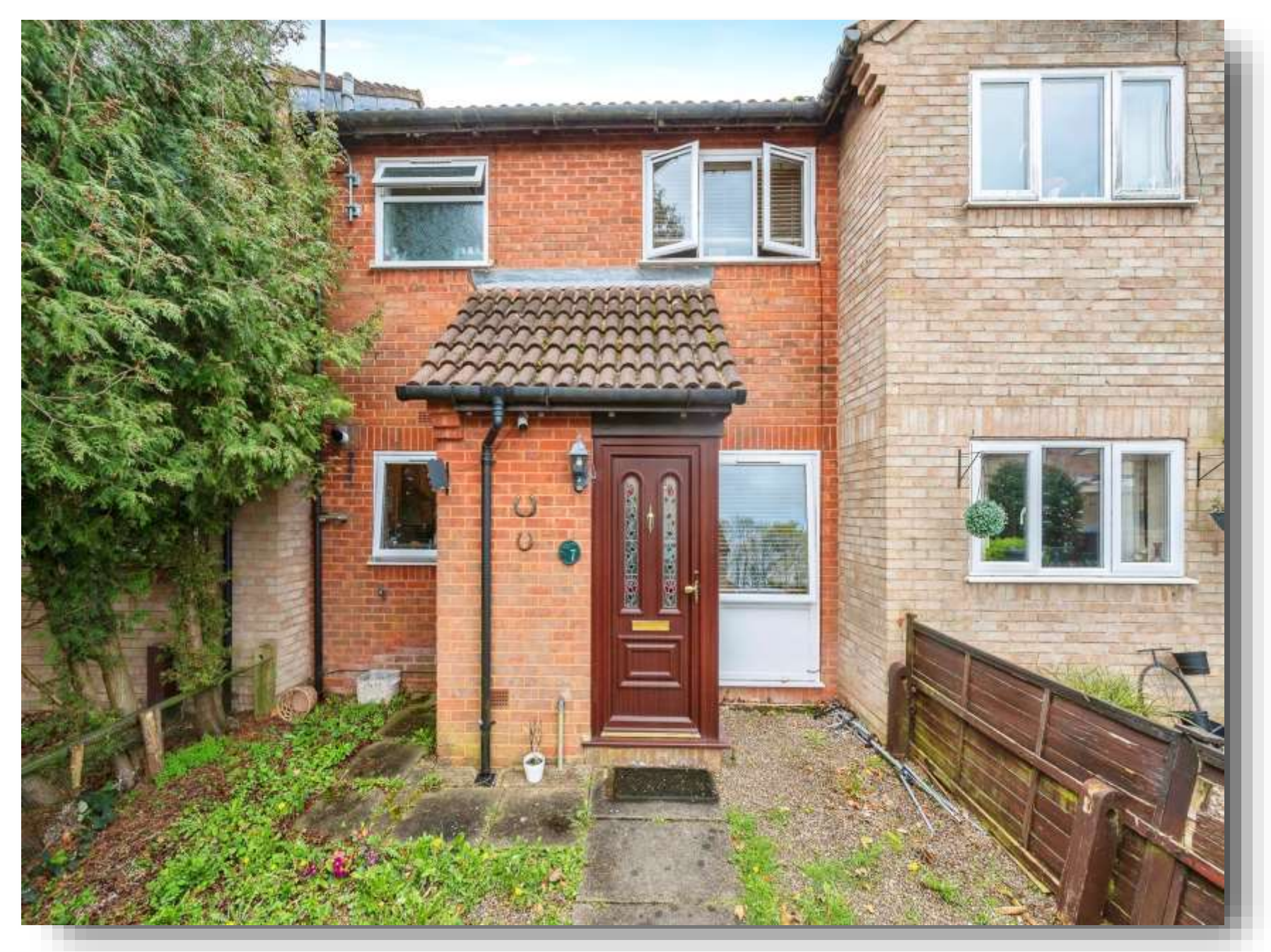
Sherwood Place, HEMEL HEMPSTEAD HP2 6PS