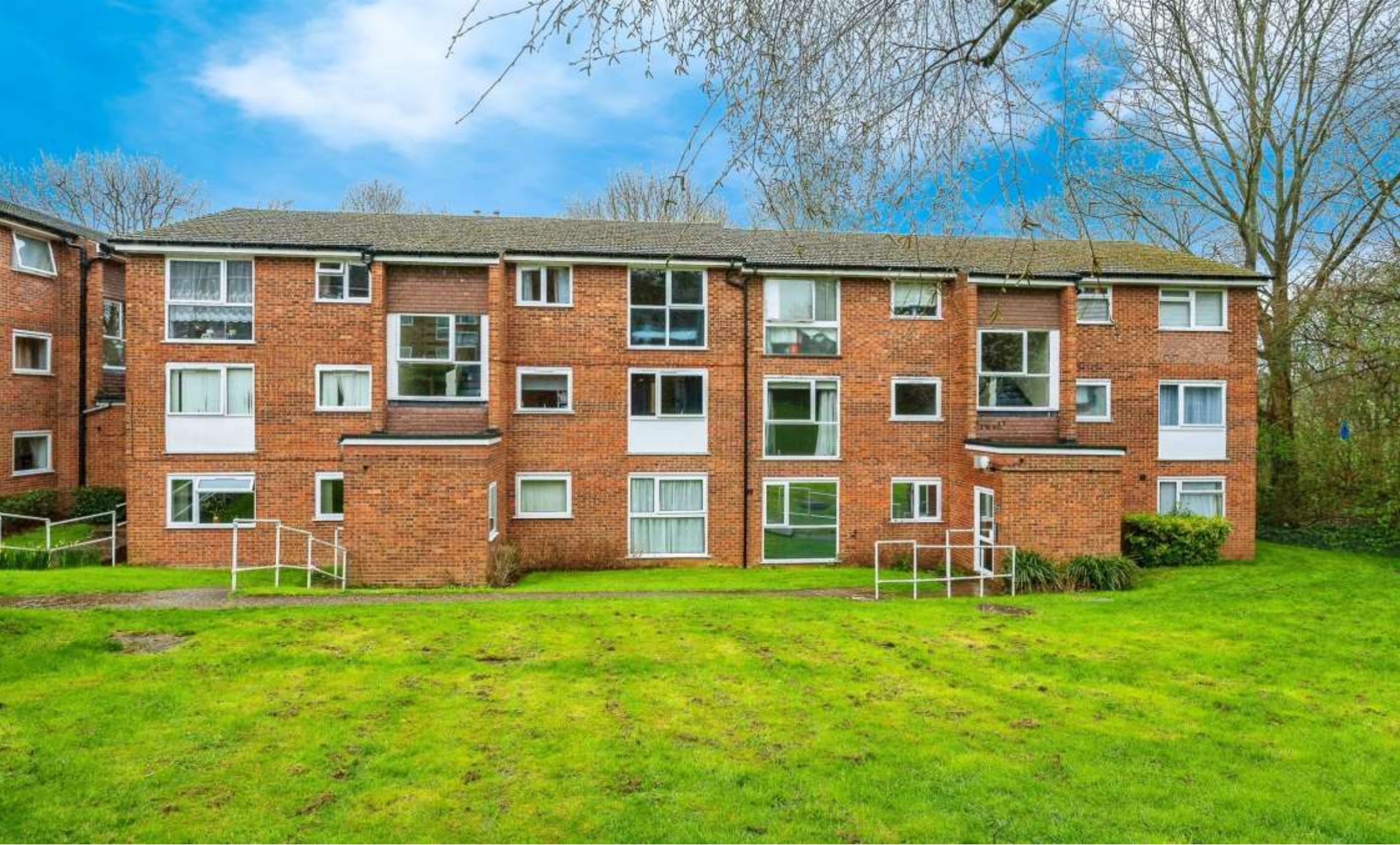
Aston View, Hemel Hempstead HP2 7NY