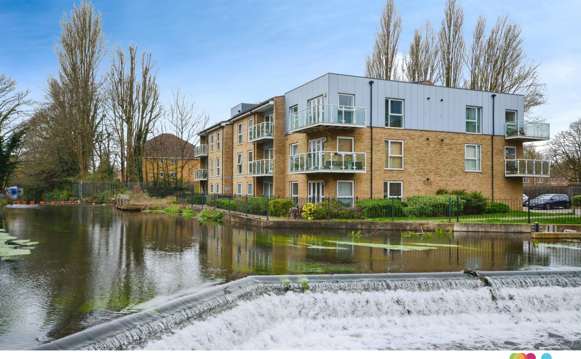
Basildon Court Croxley Road, Nash Mills Wharf Hemel Hempstead HP3 9GY