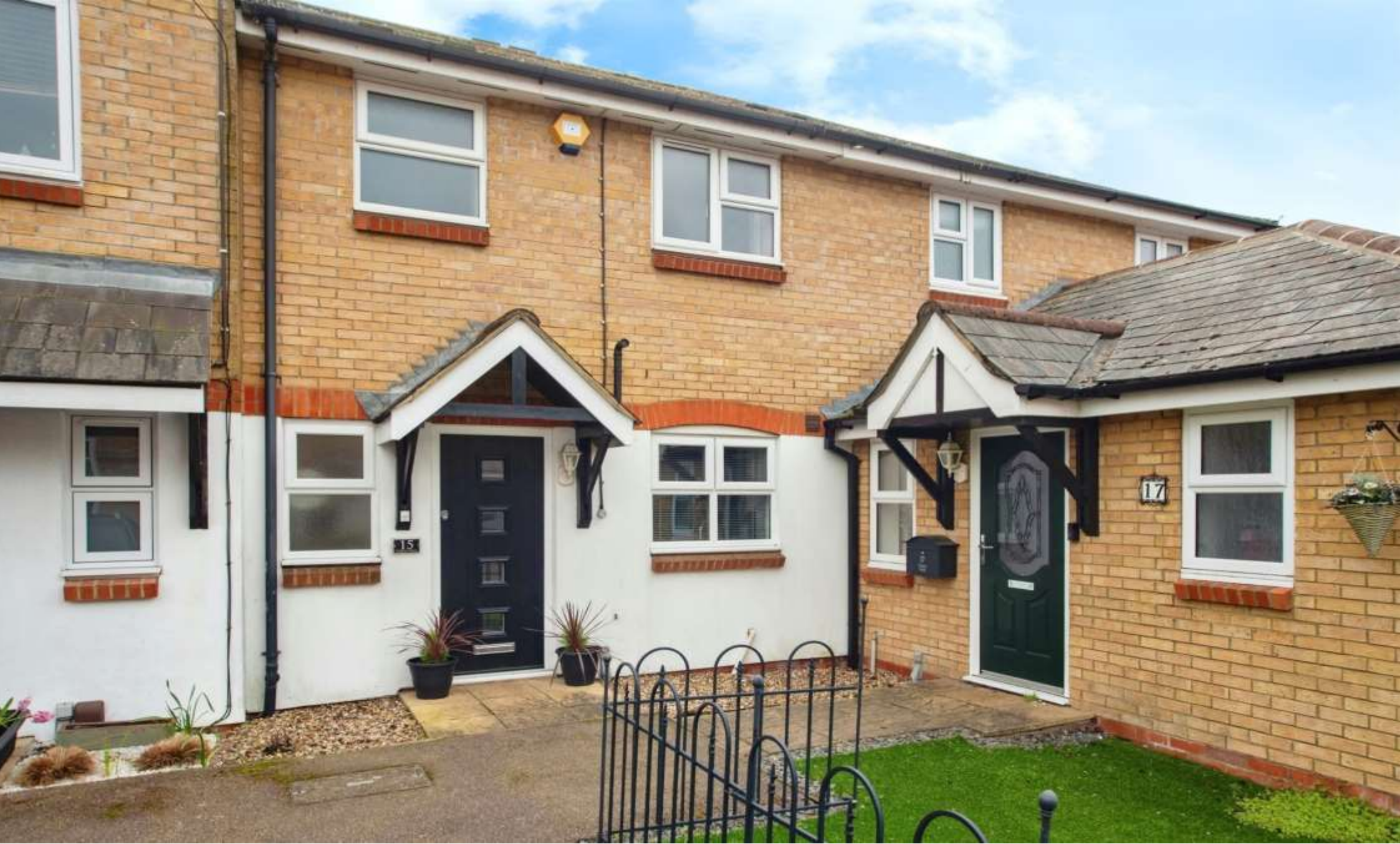
Crown Walk, Hemel Hempstead HP3 9WS