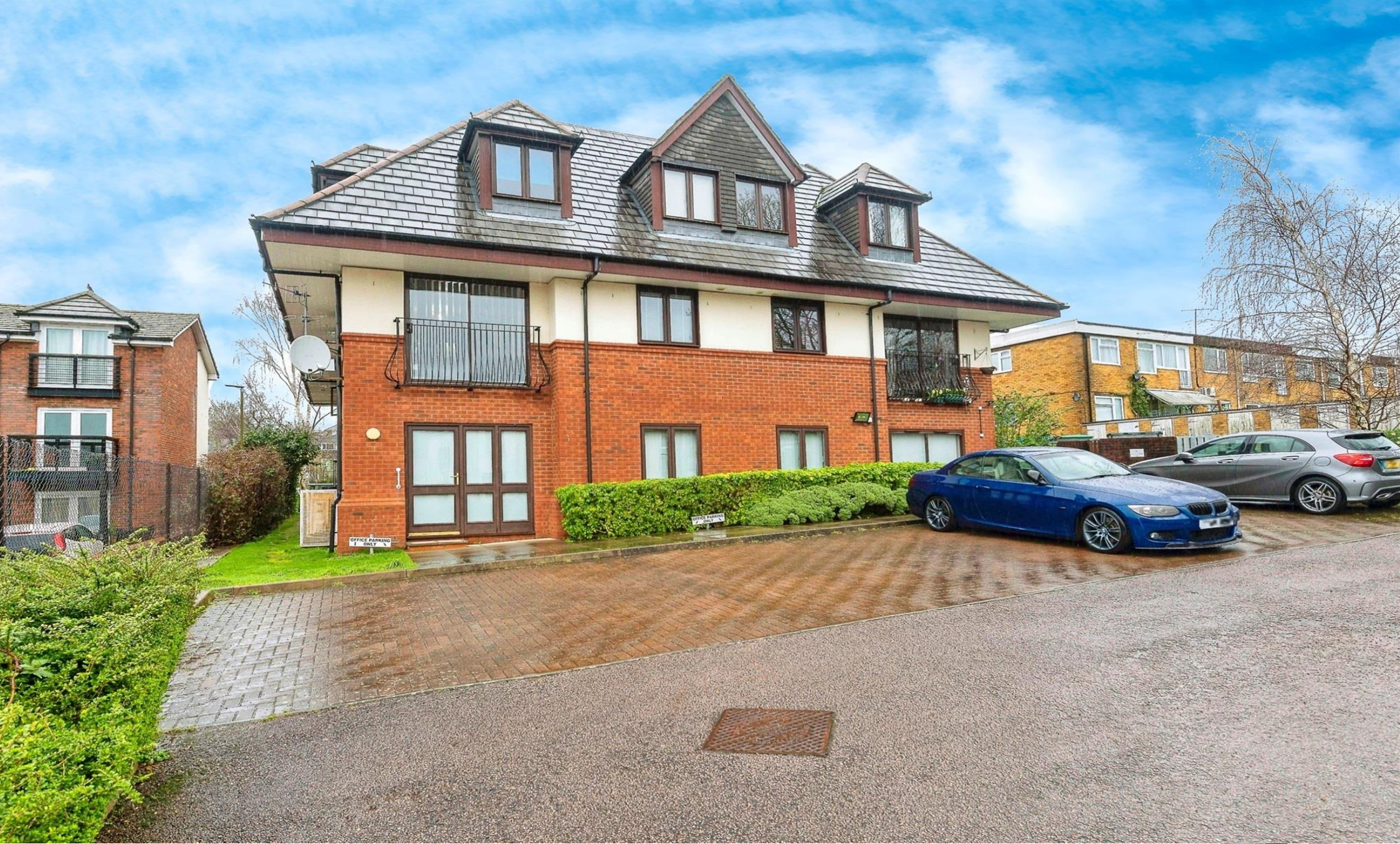
Davidson House Queensway,HEMEL HEMPSTEAD HP2 5FX