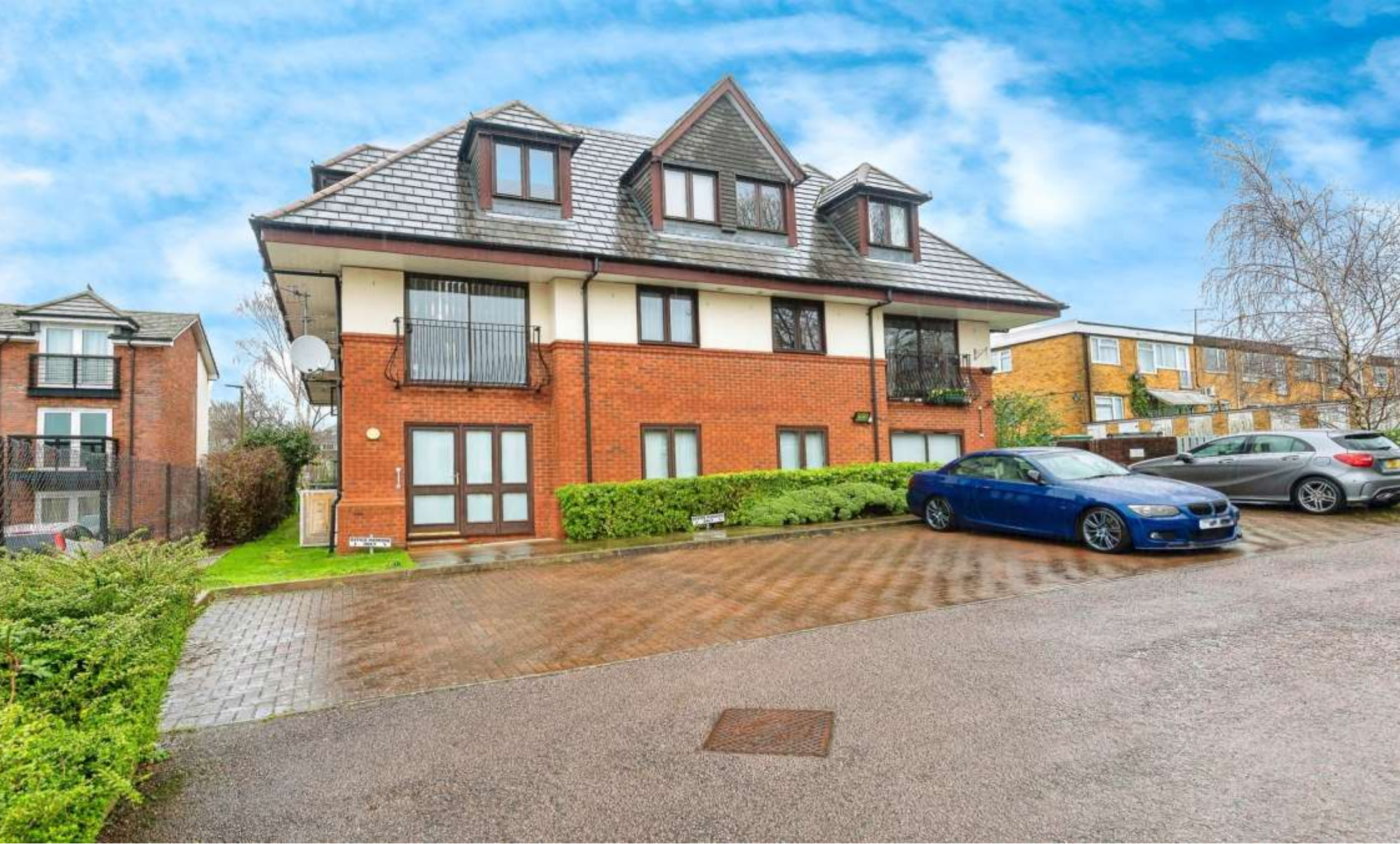
Davidson House Queensway,HEMEL HEMPSTEAD HP2 5FX