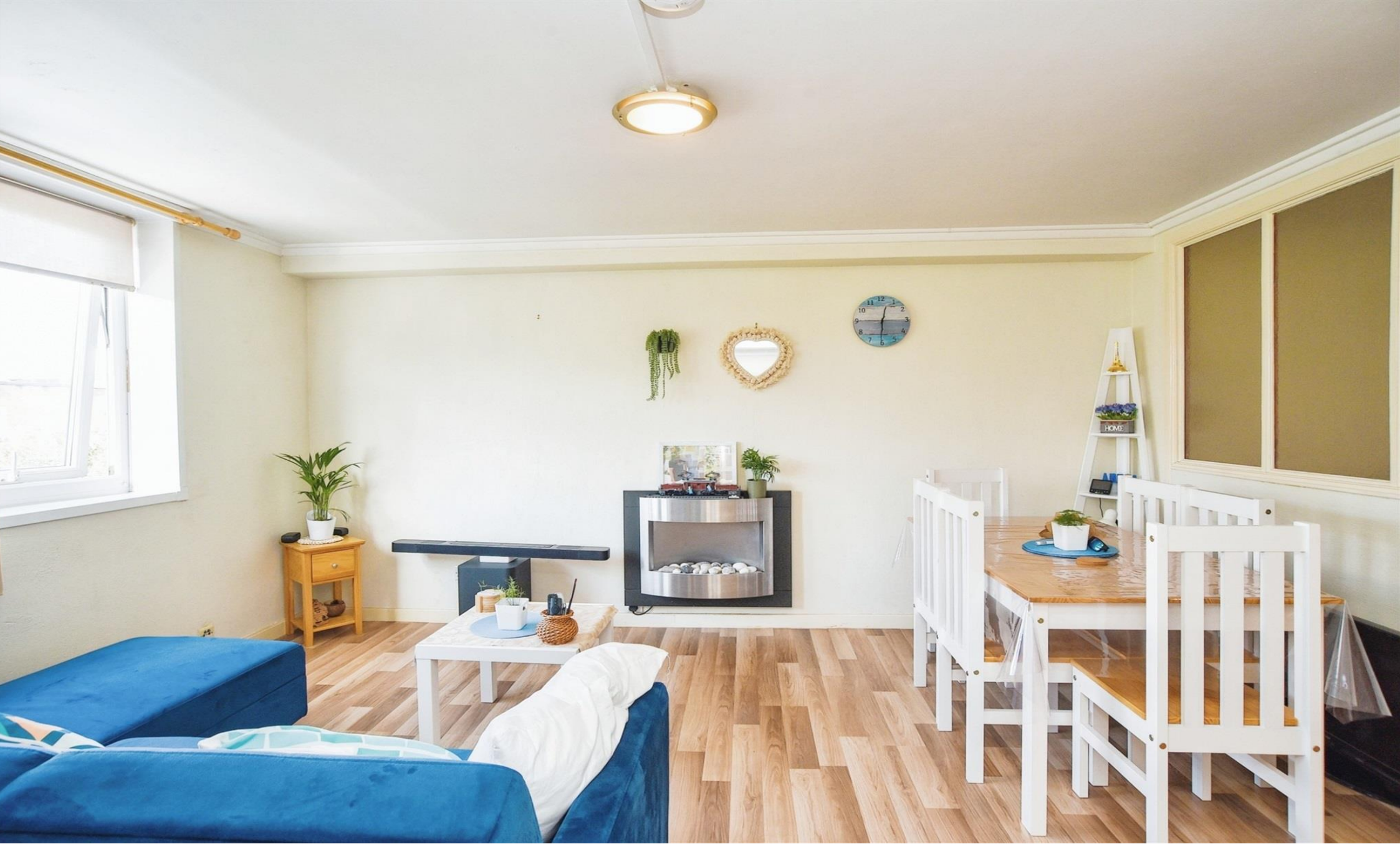
Fareham House Marlowes, Hemel Hempstead HP1 1DZ