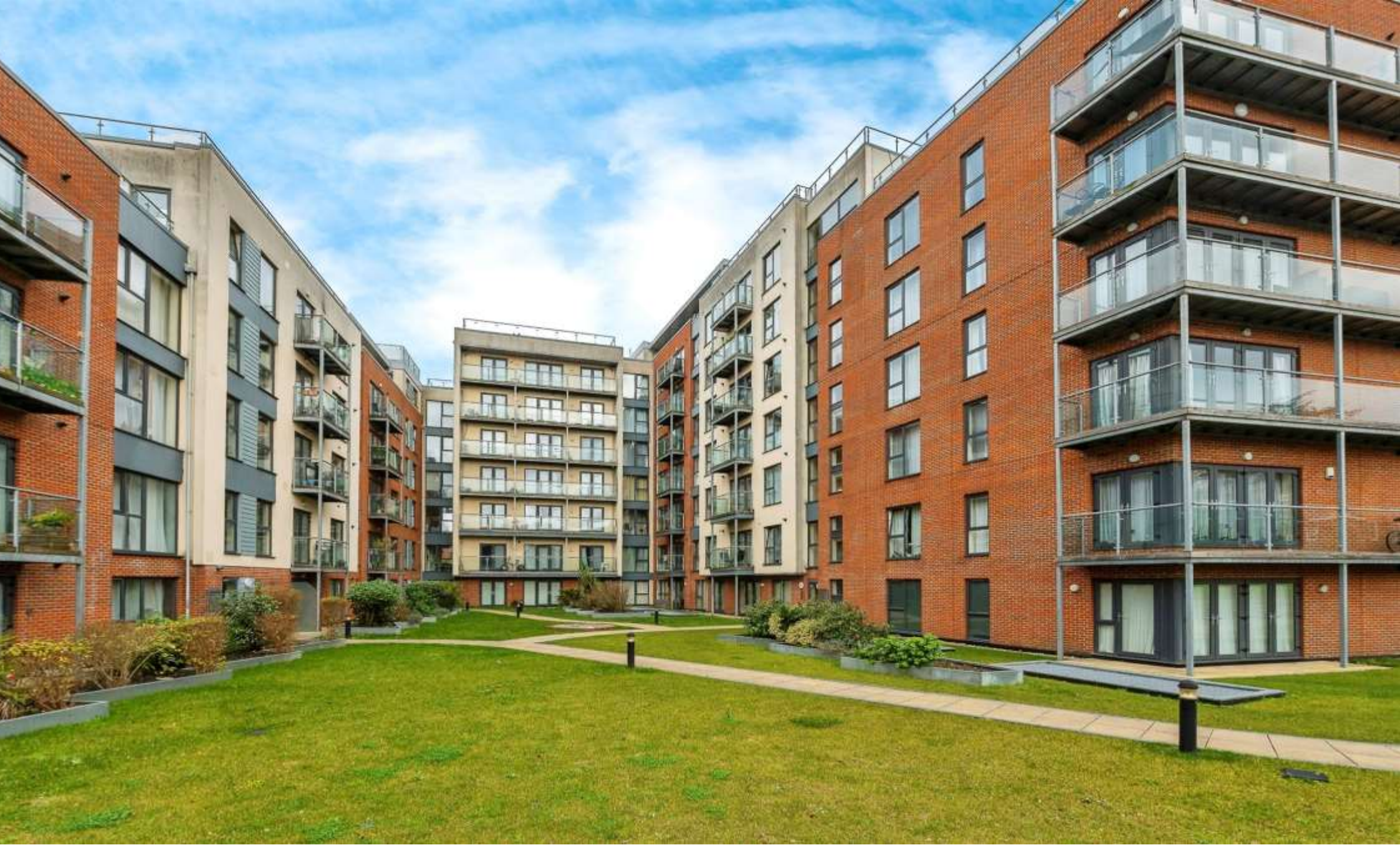
Mosaic House Midland Road, Hemel Hempstead HP2 5YQ