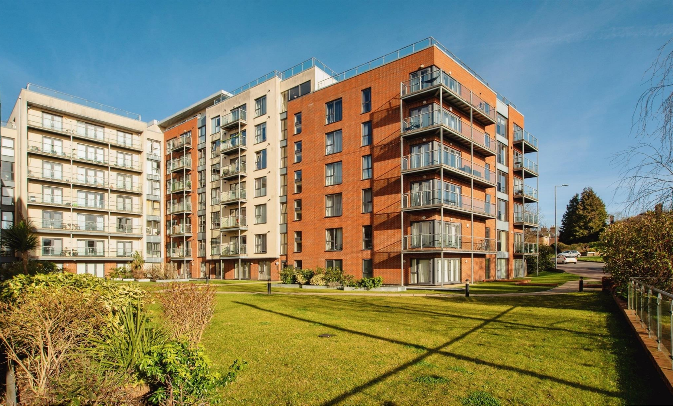
Mosaic House Midland Road, Hemel Hempstead HP2 5YQ