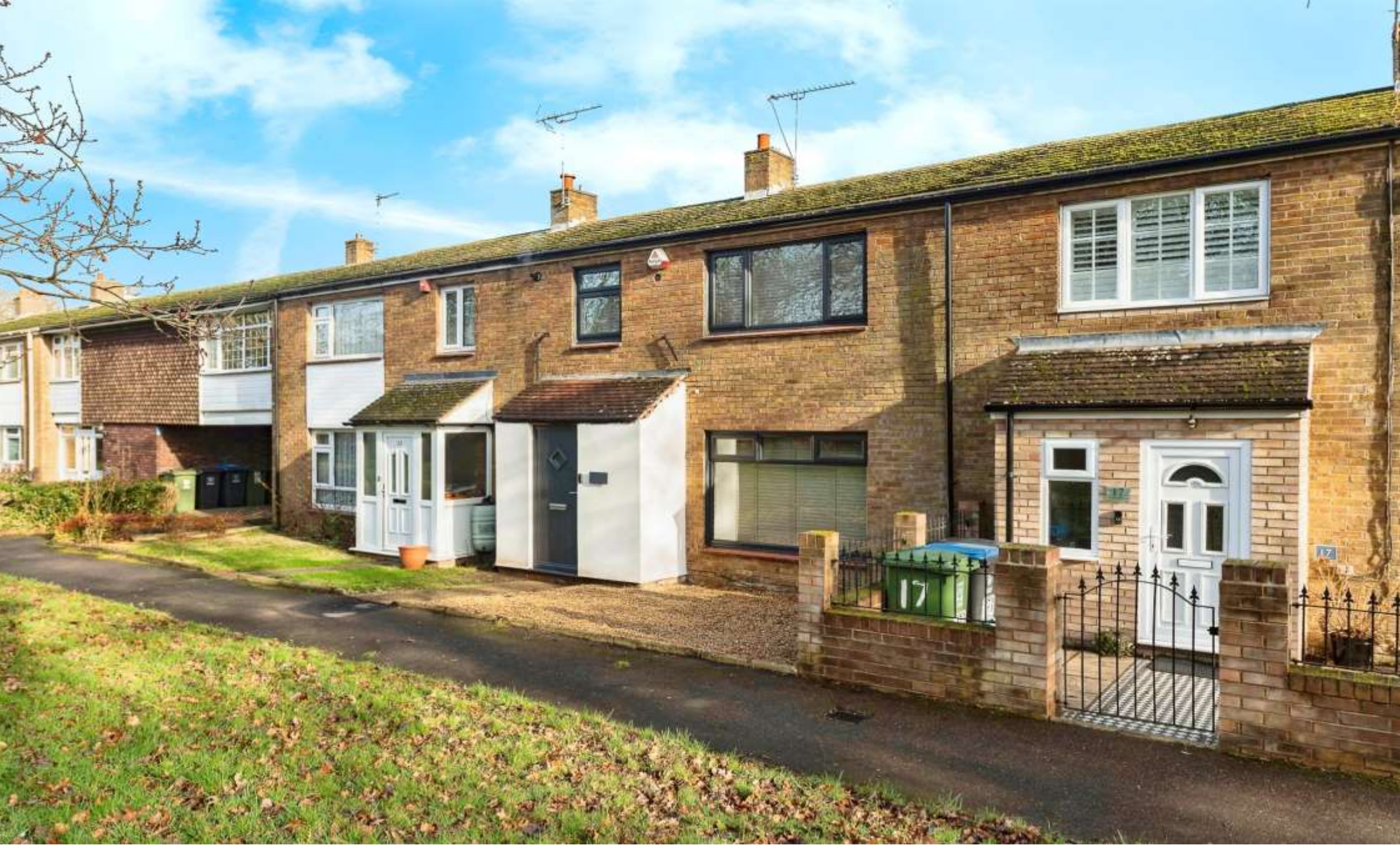
Cumberlow Place, Hemel Hempstead HP2 4PW