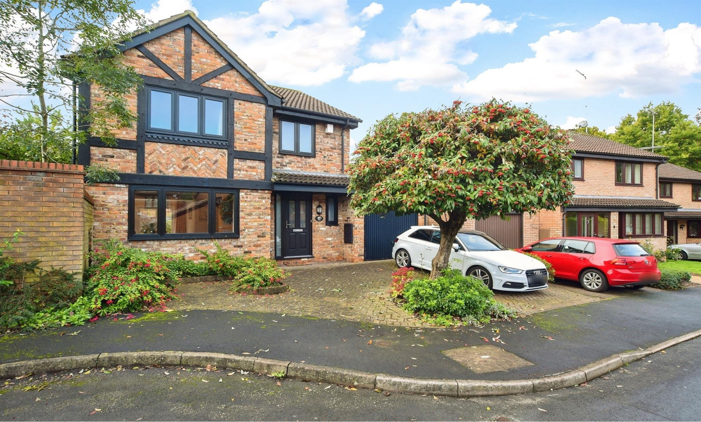
The Melings,HEMEL HEMPSTEAD HP2 7SF