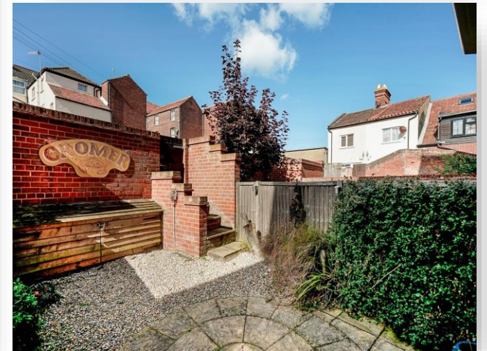
Fishermens Mews, Cromer, NR27 9GY