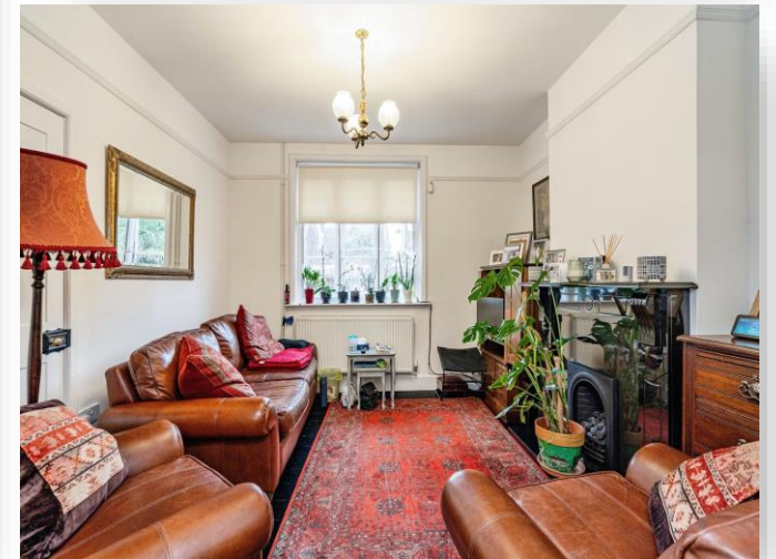
Chesterfield Villas, Cromer, NR27 9EW