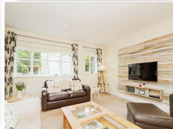
1 Meadow Cottages, High Street, Overstrand, Cromer, NR27 0AB