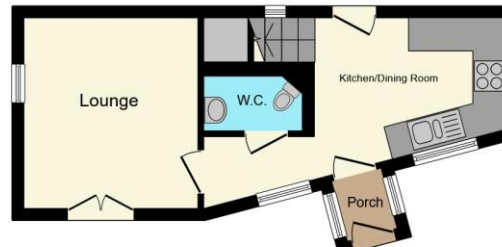
Ground Floor william h brown

Suite comprising WC, pedestal wash basin, ball & claw foot freestanding bath with shower attachment & mixer tap and double shower cubicle. Cupboard housing boiler, extractor, radiator and 2 front aspect double glazed windows.