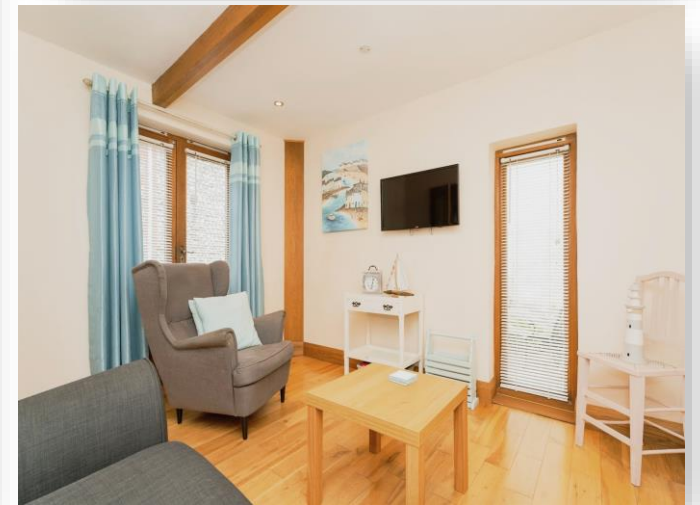
Angel Yard, Sheringham, NR26 8BD