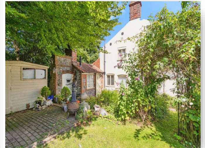
The Londs, Overstrand, Cromer, NR27 0PW