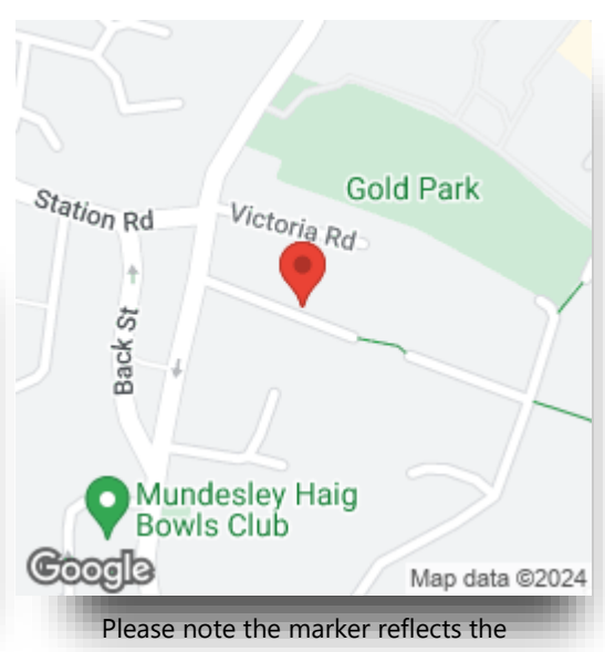
postcode not the actual property