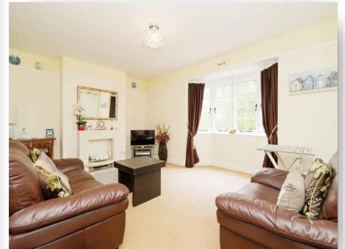
Russell Terrace, Mundesley Norwich NR11 8LJ