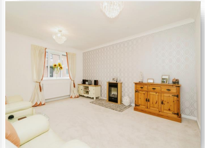
Woodhouse Close, Sheringham NR26 8AX