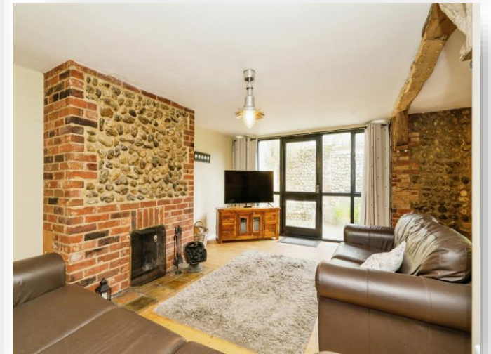
Barn Owl Cottage Cromer Road, Sidestrand Cromer NR27 0LT