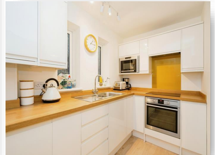
Cromer Country Club, Overstrand Road, Cromer, NR27 0DJ