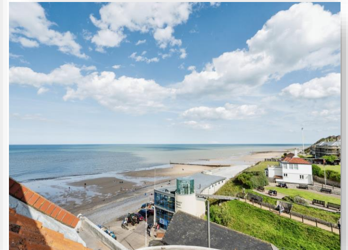
Brunswick House, Brunswick Terrace, Cromer, NR27 9EU